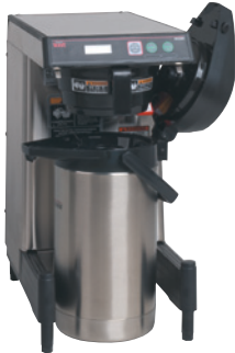
Model WAVE-APS with 2.5L lever-action Airpot (airpot sold separately)

Dimensions: 16.94-18.69" H x 9.71 W x 17.24"D (43cm H x 22.2cm W x 43.8cm D)