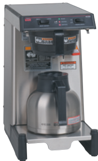
Model WAVE-S-APS with Deluxe 1.9L Thermal Carafe (thermal carafe sold separately)

Dimensions: 16.94-18.69" H x 9.71 W x 17.24"D (43cm H x 22.2cm W x 43.8cm D)